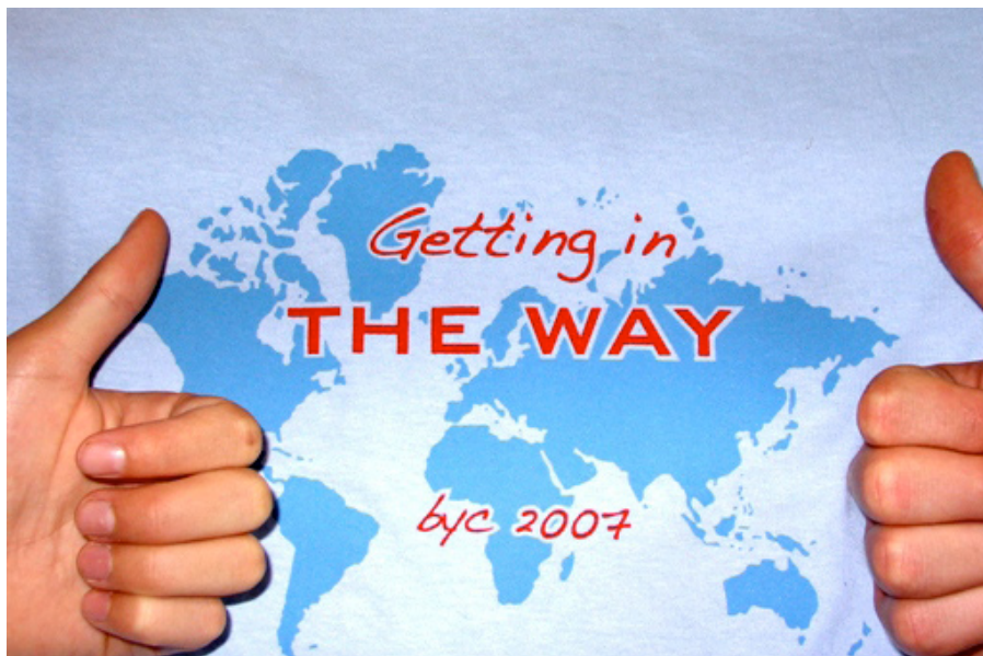
T-shirt design for BYC 2007

We envision authentic community where young people and adult guides can be accepted, affirmed and empowered: students and teachers, male and female, gay and straight, the athlete and the artist. We are a family, growing-up, growing together, growing apart, coming together, coming out and moving-on. Our reunion is in July. With the presence of Spirit