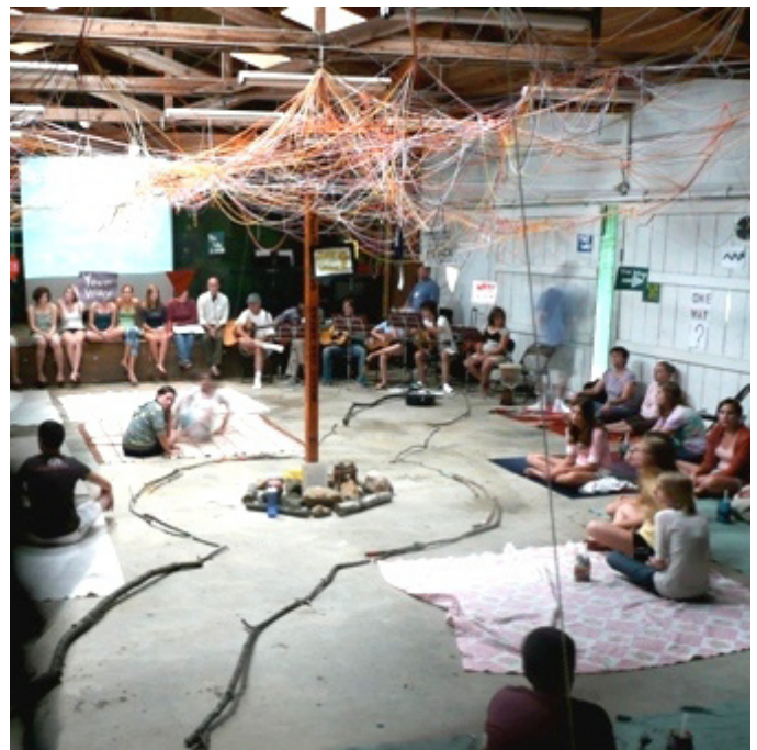
Worship experience at BYC