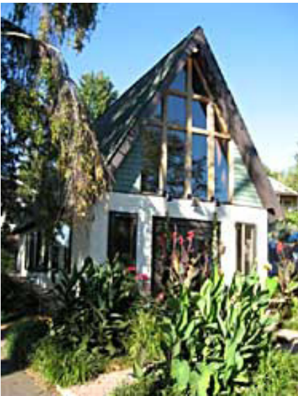
Chapel at Western North Carolina Community Health Services, site of the covenant vow ceremony

But we don't just make demands. We also make promises. And among those promises are the ones being signified and blessed in this sanctuary, as we surround these couples who conclude this party with a public recognition of the promises they have made to each other—vows which they invite each of you to overhear, to attest and to bless.